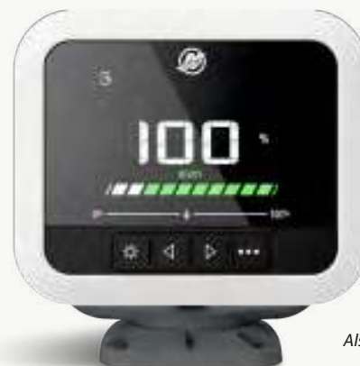
Pedestal-Style Console Display (shown)

Also Available in Flush-Mount Console Display