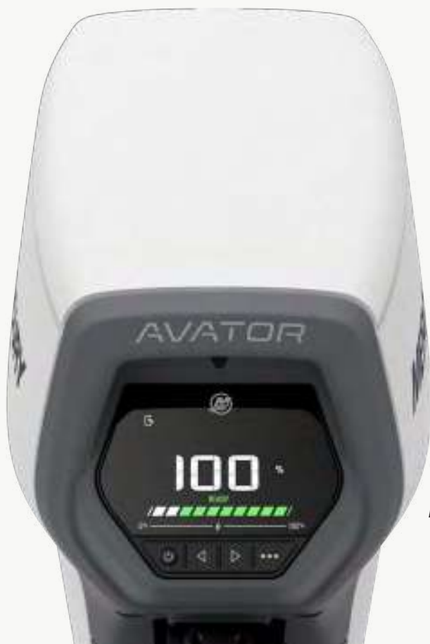
Integrated Outboard Display for Tiller Models

Monitor and control your Avator propulsion system from a vivid full-color display, optimized for readability in all light conditions. Your display shares speed, battery level, time and distance to “empty,” power output, and alerts. Everything you need to know to get the most from any journey.